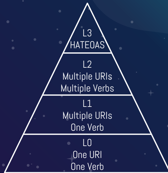
Richardson Maturity Model