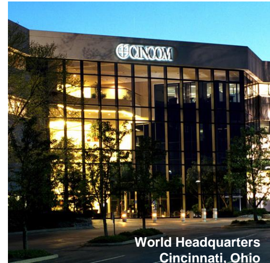
World Headquarters Cincinnati, Ohio