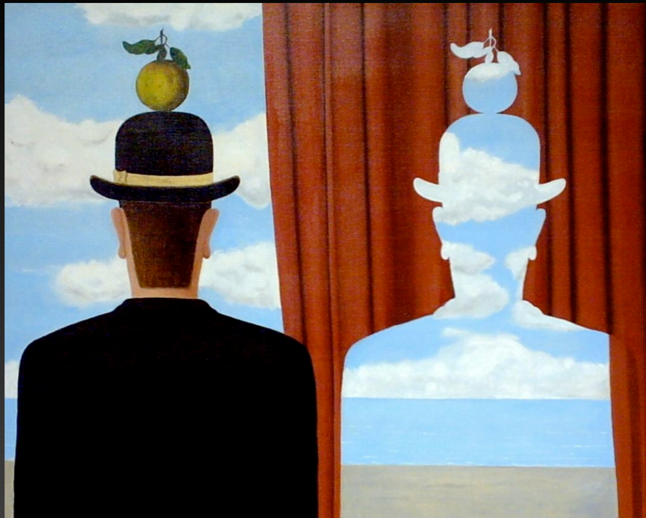
[René Magritte, 1966] Decalcomania